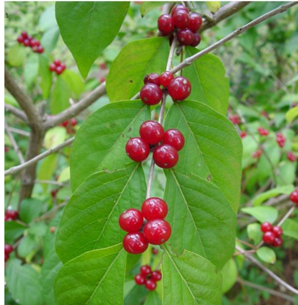
Amur Honeysuckle berries.