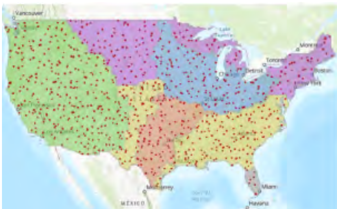
Figure 1. Randomly-selected IMMP priority sampling locations.

The IMMP accommodates data from almost any location. There are two main ways in which the program identifies sites for monitoring: