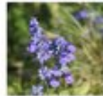
Mealy Blue Sage

NON-NATIVE INVASIVE TREES Bamboo Chinese Elm Chinese Yellow Wax Leaf Ligustrum Tree of Heaven