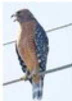
Red Shouldered Hawk

BIRDS American Robin Black Bellied Whistling Duck Black Crowned Titmouse Blue-gray Gnatcatcher Blue Jay Brown-headed Cow Bird Carolina Chickadee Cedar Waxwing Common Raven Iowa Dove Mourning Dove White Wing Dove Eastern Phoebe Grackle Common Grackle Green-backed Goldfinch American Goldfinch Lesser Goldfinch Broadwinged Hawk Cooper's Hawk Red Shouldered Hawk Red Tailed Hawk Hairy Woodpecker Black-crowned Kinglet Ruby-throated Hummingbird Least Flycatcher Meadowlark Northern Cardinal Northern Harrier Northern Mockingbird Ruby-crowned Kinglet Sparrow Chipping Sparrow House Swallow Barn Swallow Cliff Swallow Chimney Swift Turkey Vulture Black Vulture Woodpecker Golden-crowned Woodpecker Ladder-back Woodpecker Nashville Warbler Orange-crowned Warbler Tennessee Warbler Wilson's Warbler Yellow Warbler White-eyed Vireo Carolina Wren Bewick's Wren Yellow-breasted Chat