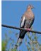
White Wing Dove