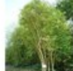
Wax Leaf Ligustrum